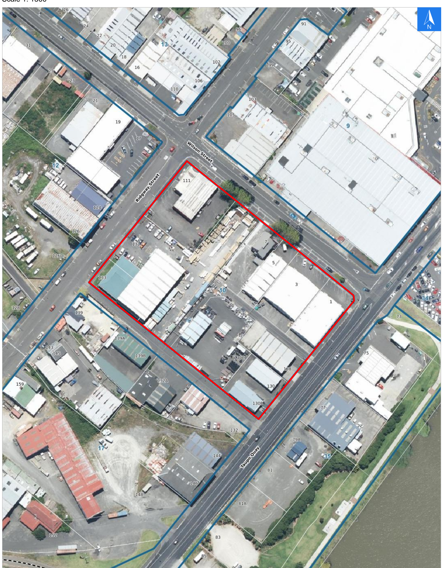
Scale 1: 1500

Digital map data sourced from Land Information New Zealand CROWN COPYRIGHT RESERVED. The information displayed in the GIS has been taken from Whanganui District Council's databases and maps. It is made available in good faith but its accuracy or completeness is not guaranteed. If the information is relied on in support of a resource consent it should be verified independently.