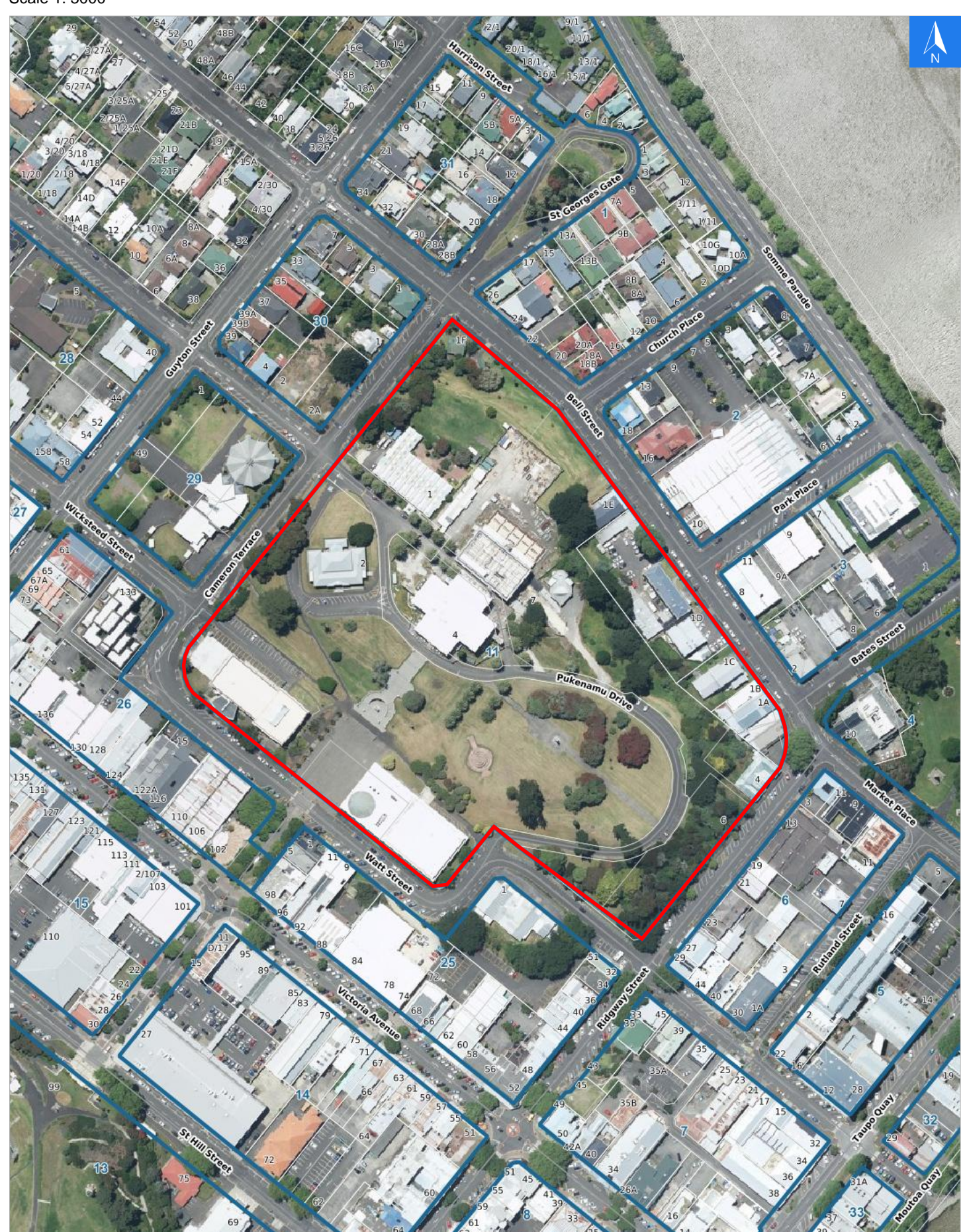
Scale 1: 3000

Digital map data sourced from Land Information New Zealand CROWN COPYRIGHT RESERVED. The information displayed in the GIS has been taken from Whanganui District Council's databases and maps. It is made available in good faith but its accuracy or completeness is not guaranteed. If the information is relied on in support of a resource consent it should be verified independently.