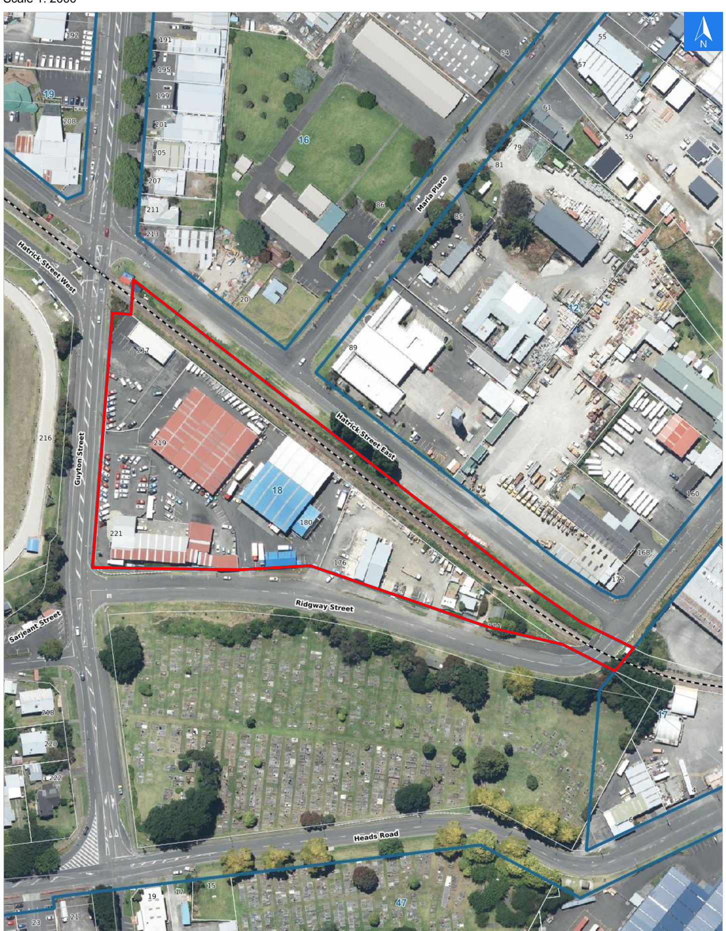
Scale 1: 2000

Digital map data sourced from Land Information New Zealand CROWN COPYRIGHT RESERVED. The information displayed in the GIS has been taken from Whanganui District Council's databases and maps. It is made available in good faith but its accuracy or completeness is not guaranteed. If the information is relied on in support of a resource consent it should be verified independently.