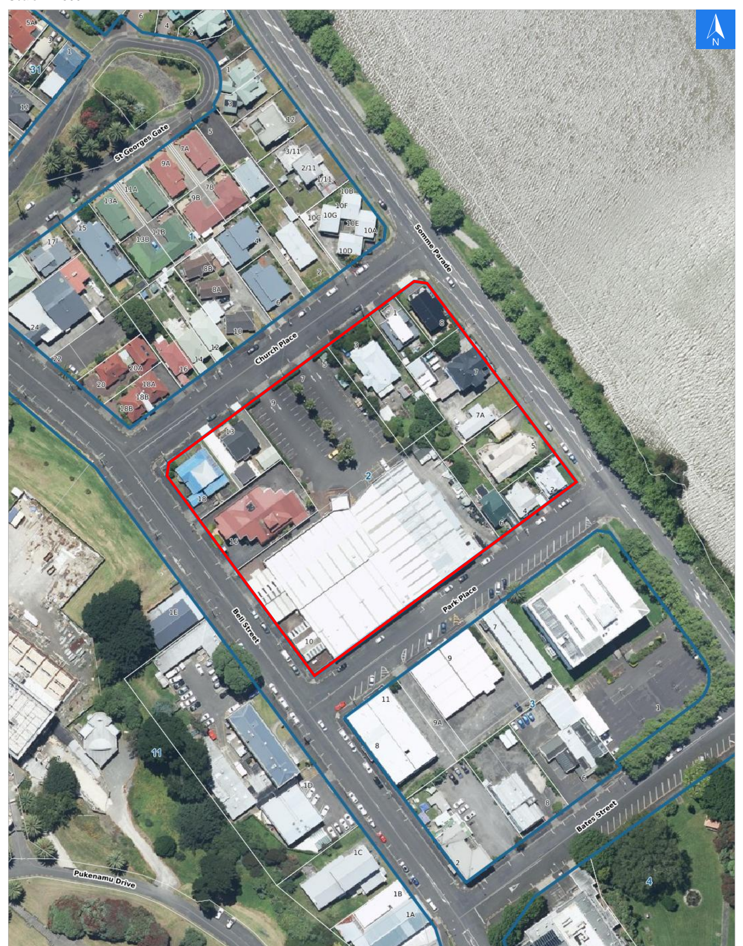
Scale 1: 1500

Digital map data sourced from Land Information New Zealand CROWN COPYRIGHT RESERVED. The information displayed in the GIS has been taken from Whanganui District Council's databases and maps. It is made available in good faith but its accuracy or completeness is not guaranteed. If the information is relied on in support of a resource consent it should be verified independently.