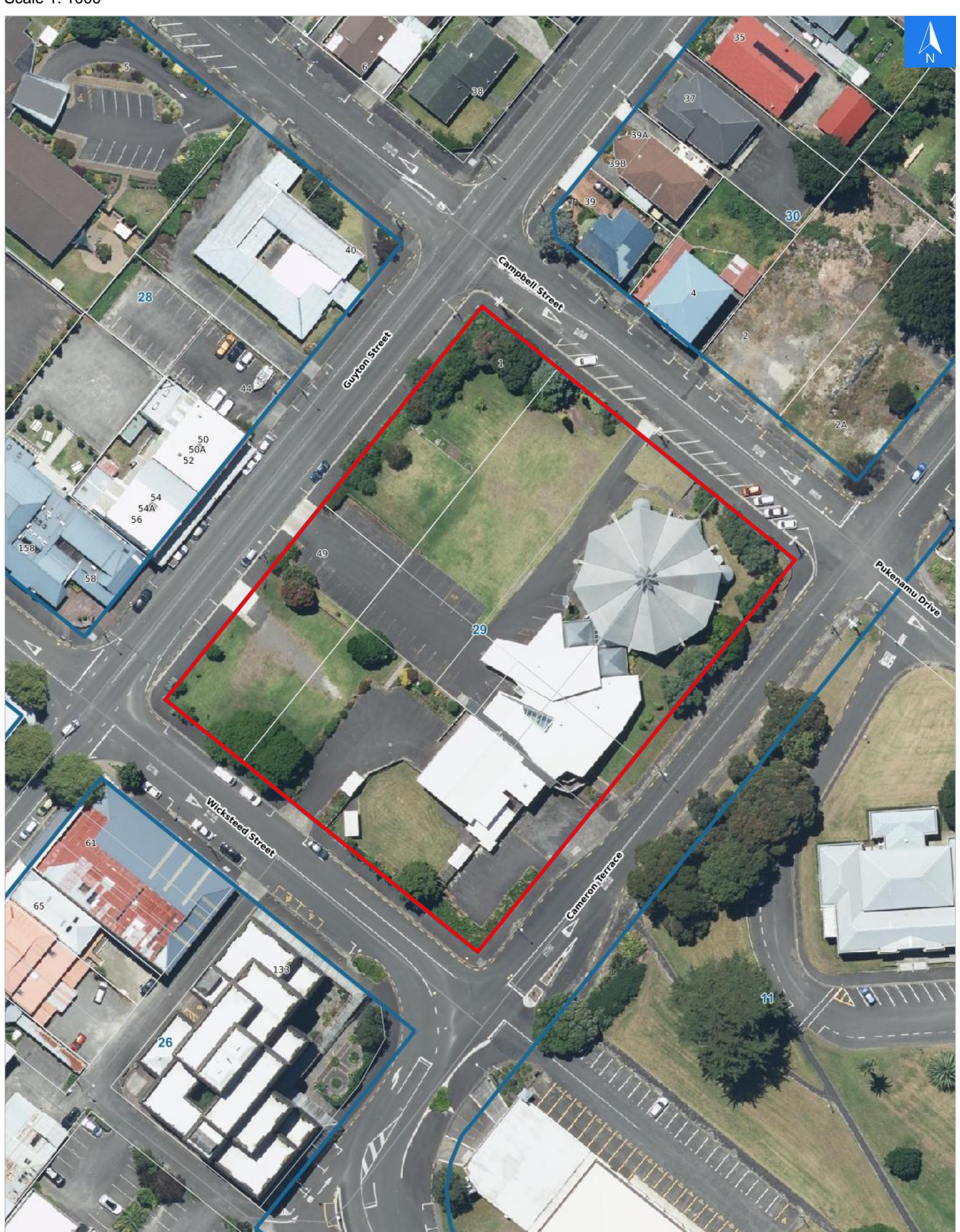
Scale 1: 1000

Digital map data sourced from Land Information New Zealand CROWN COPYRIGHT RESERVED. The information displayed in the GIS has been taken from Whanganui District Council's databases and maps. It is made available in good faith but its accuracy or completeness is not guaranteed. If the information is relied on in support of a resource consent it should be verified independently.