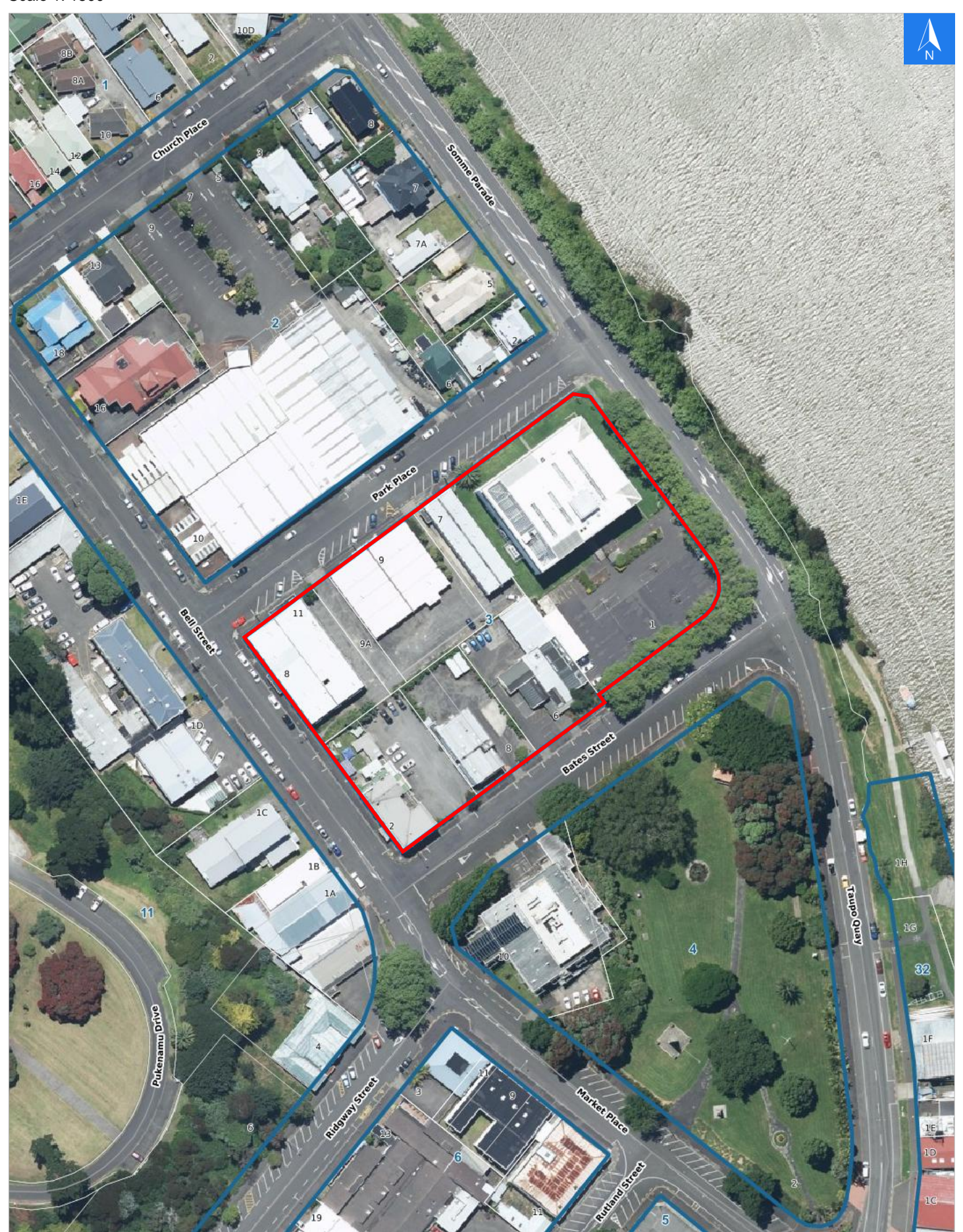
Scale 1: 1500

Digital map data sourced from Land Information New Zealand CROWN COPYRIGHT RESERVED. The information displayed in the GIS has been taken from Whanganui District Council's databases and maps. It is made available in good faith but its accuracy or completeness is not guaranteed. If the information is relied on in support of a resource consent it should be verified independently.