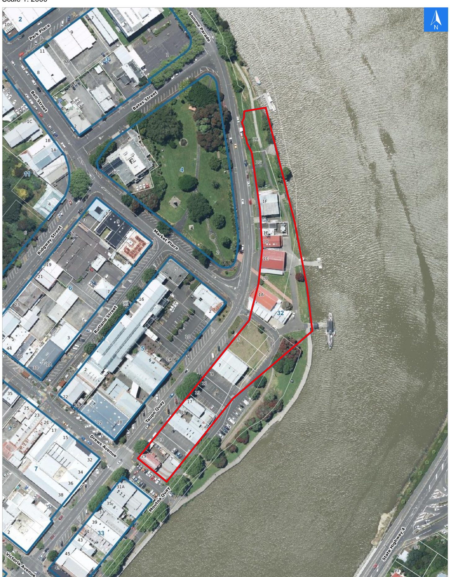
Scale 1: 2000

Digital map data sourced from Land Information New Zealand CROWN COPYRIGHT RESERVED. The information displayed in the GIS has been taken from Whanganui District Council's databases and maps. It is made available in good faith but its accuracy or completeness is not guaranteed. If the information is relied on in support of a resource consent it should be verified independently.