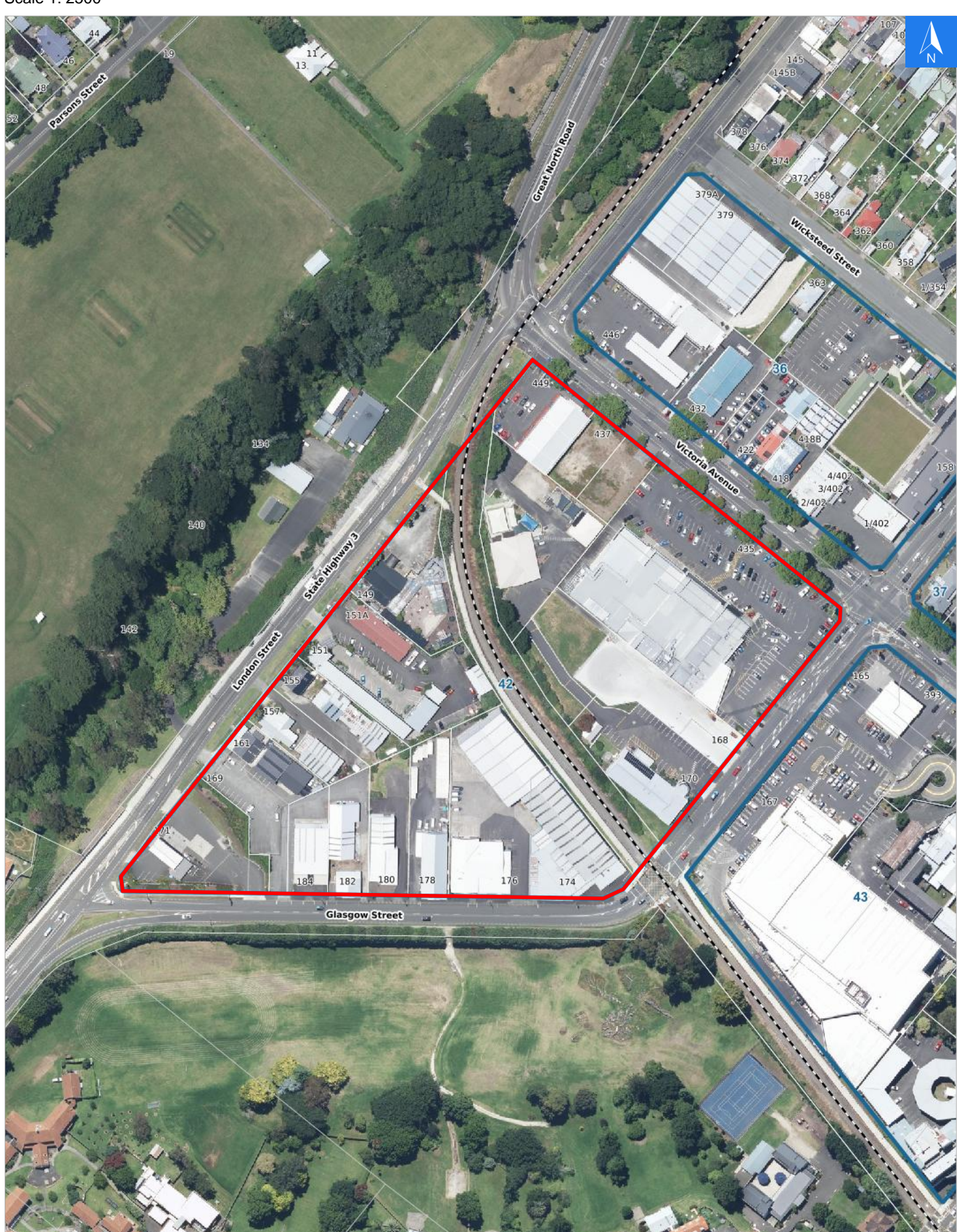
Scale 1: 2500

Digital map data sourced from Land Information New Zealand CROWN COPYRIGHT RESERVED. The information displayed in the GIS has been taken from Whanganui District Council's databases and maps. It is made available in good faith but its accuracy or completeness is not guaranteed. If the information is relied on in support of a resource consent it should be verified independently.