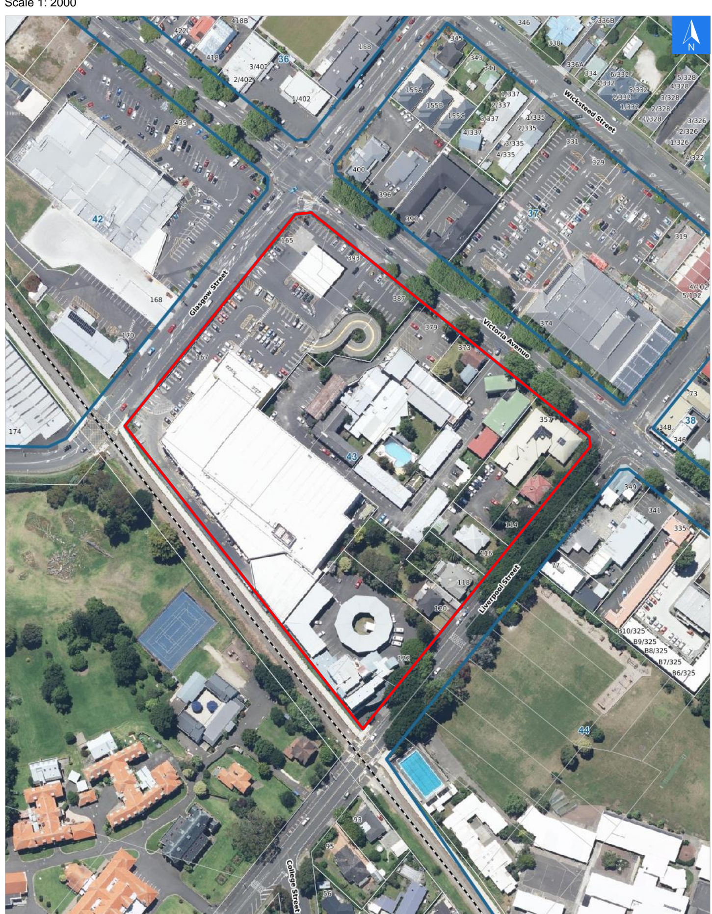
Scale 1: 2000

Digital map data sourced from Land Information New Zealand CROWN COPYRIGHT RESERVED. The information displayed in the GIS has been taken from Whanganui District Council's databases and maps. It is made available in good faith but its accuracy or completeness is not guaranteed. If the information is relied on in support of a resource consent it should be verified independently.