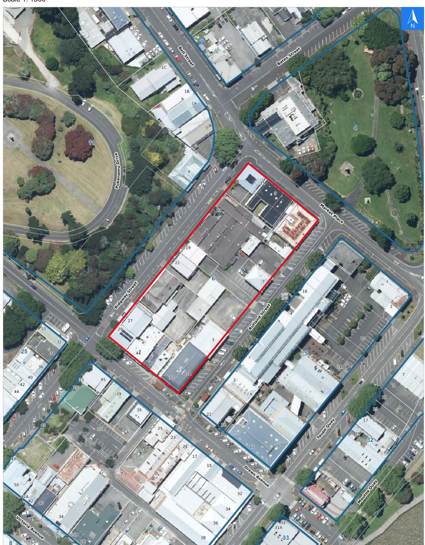
Scale 1: 1500

Digital map data sourced from Land Information New Zealand CROWN COPYRIGHT RESERVED. The information displayed in the GIS has been taken from Whanganui District Council's databases and maps. It is made available in good faith but its accuracy or completeness is not guaranteed. If the information is relied on in support of a resource consent it should be verified independently.