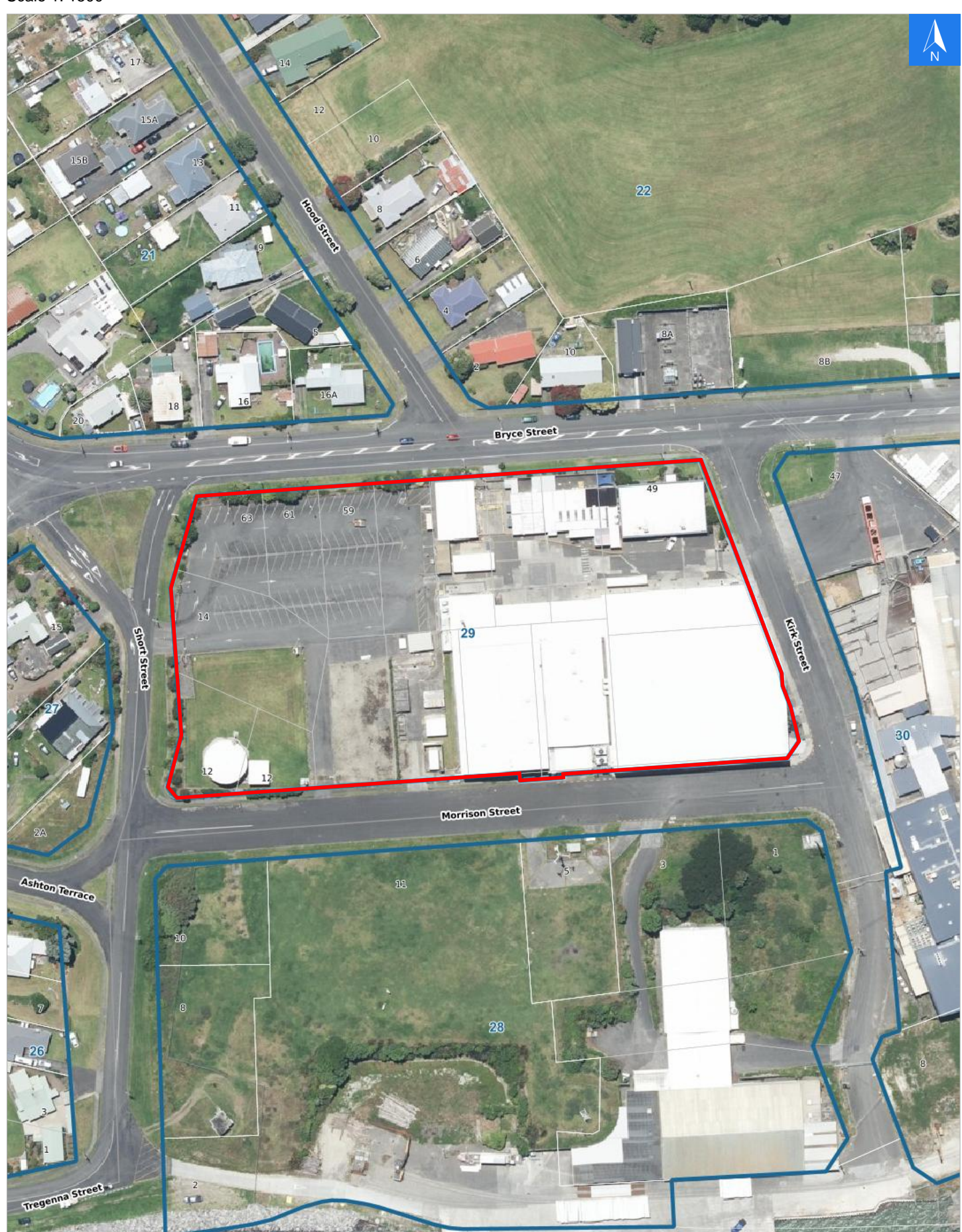
Scale 1: 1500

Digital map data sourced from Land Information New Zealand CROWN COPYRIGHT RESERVED. The information displayed in the GIS has been taken from Whanganui District Council's databases and maps. It is made available in good faith but its accuracy or completeness is not guaranteed. If the information is relied on in support of a resource consent it should be verified independently.