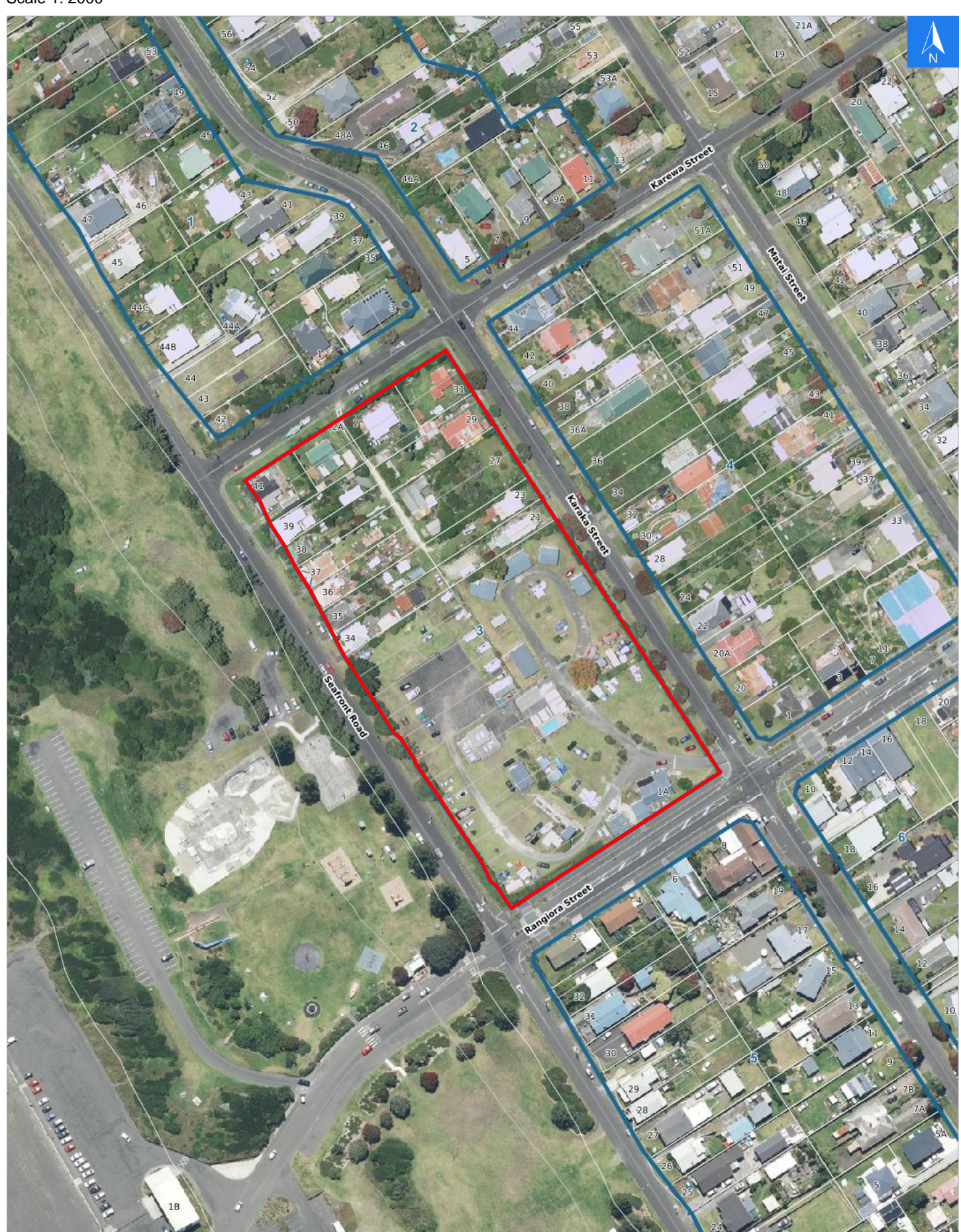
Scale 1: 2000

Digital map data sourced from Land Information New Zealand CROWN COPYRIGHT RESERVED. The information displayed in the GIS has been taken from Whanganui District Council's databases and maps. It is made available in good faith but its accuracy or completeness is not guaranteed. If the information is relied on in support of a resource consent it should be verified independently.