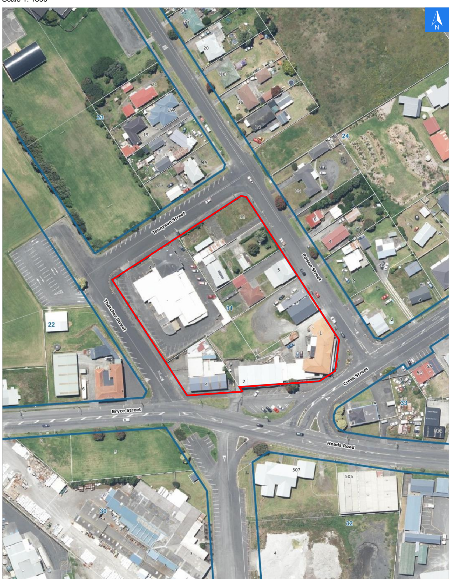
Scale 1: 1500

Digital map data sourced from Land Information New Zealand CROWN COPYRIGHT RESERVED. The information displayed in the GIS has been taken from Whanganui District Council's databases and maps. It is made available in good faith but its accuracy or completeness is not guaranteed. If the information is relied on in support of a resource consent it should be verified independently.